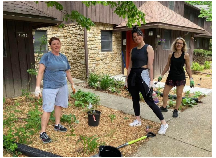
Homeowners planting native plant species at the volunteer day!