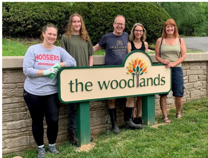
Homeowners at The Woodlands entrance sign on the day of the 2023 Spring community Volunteer Day!

Spring Community Volunteer Event: Over 20 homeowners showed up in May for our event! Together we were able to get a lot done around the neighborhood. This included removing invasive species, planting native plant species, putting out two new picnic tables and benches in the common areas, restoring the common area hammock area, restoring dog stations, and cleaning up the neighborhood. Thank you to everyone who volunteered, from those who did winter plantings in milk jugs, all the way through the big volunteer day! We have many homeowners who quietly help out in many different ways and we appreciate you. If there is a particular project you want to help with, please put in a homeowner request on our website to join a committee, ask to volunteer or just let us know what you would like to work on. We are coming together as a community in a positive way to show what good actions we can do together as a neighborhood. This time of collaborative work will also help us to secure grant funding, so every little bit helps!!!