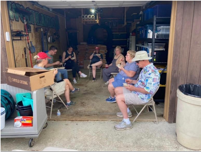
Homeowner at the spring social!

The community social was a big hit this year. It happened right after the Spring Community Volunteer Day. With all that hard work together, the food never tasted so good!