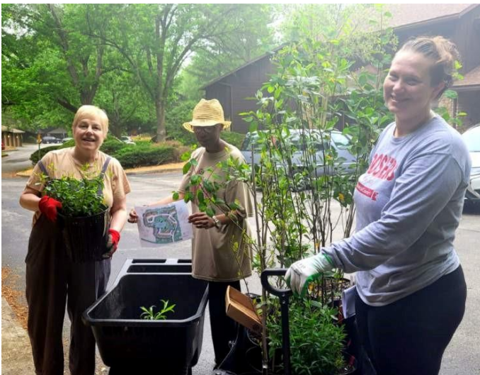
Homeowners putting out native plant species for planting!

A massive effort has been made recently to repair and restore our common areas for all homeowners to enjoy!