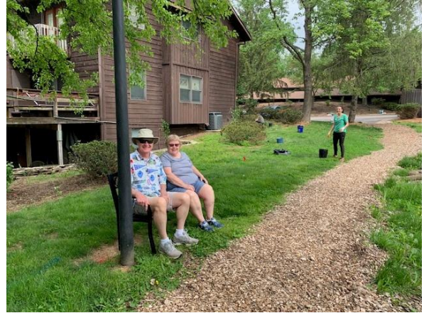
Homeowners sitting on a bench they just built for the community!